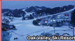
Oak Valley Ski Resort