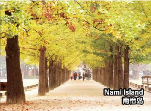
Nami Island 南怡岛