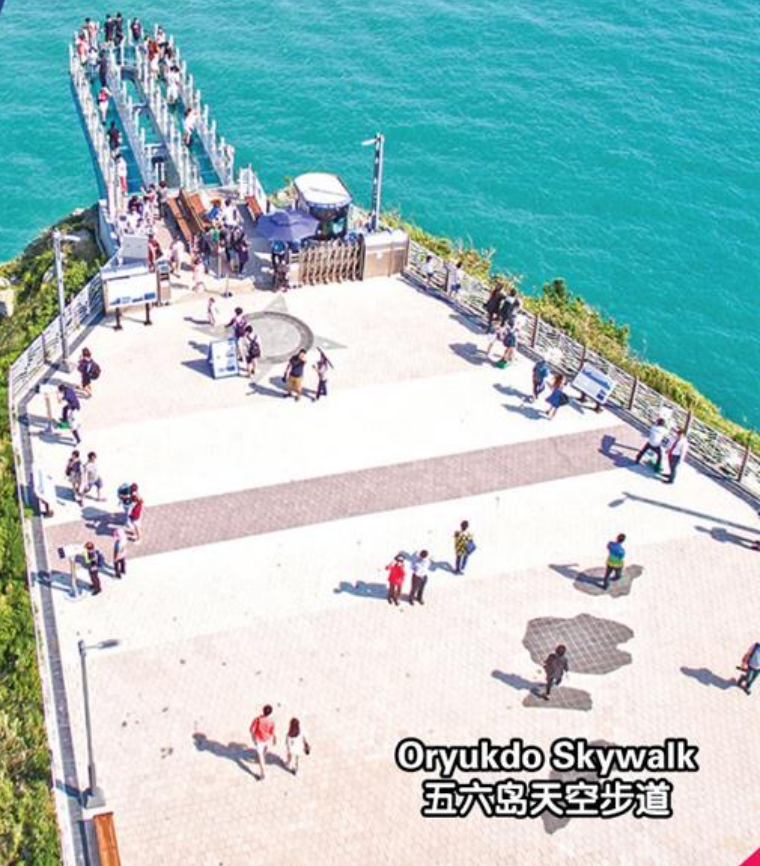
Oryukdo Skywalk 五六岛天空步道

行程次序，以当地旅行社安排为准。 Sequences of itinerary are subject to local arrangement.