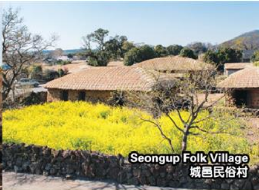
Seongup Folk Village 城邑民俗村