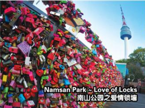
Namsan Park ~ Love of Locks 南山公园之爱情锁墙