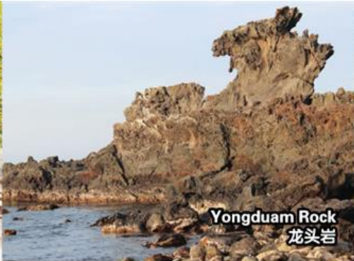
Yongduam Rock 龙头岩