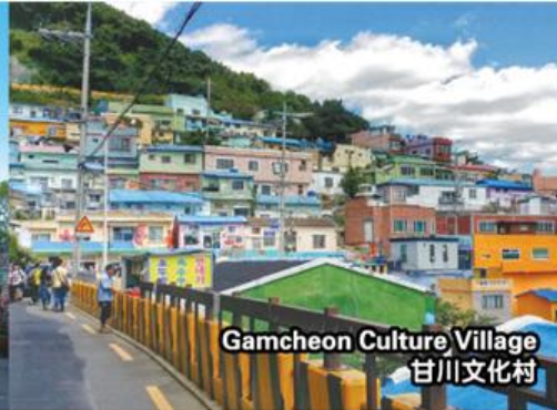
Gamcheon Culture Village 甘川文化村