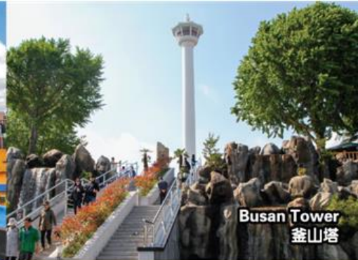
Busan Tower 釜山塔