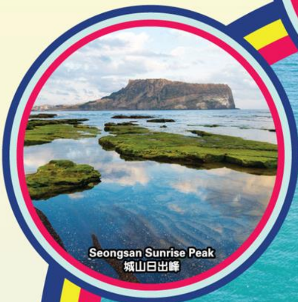
Seongsan Sunrise Peak 城山日出峰