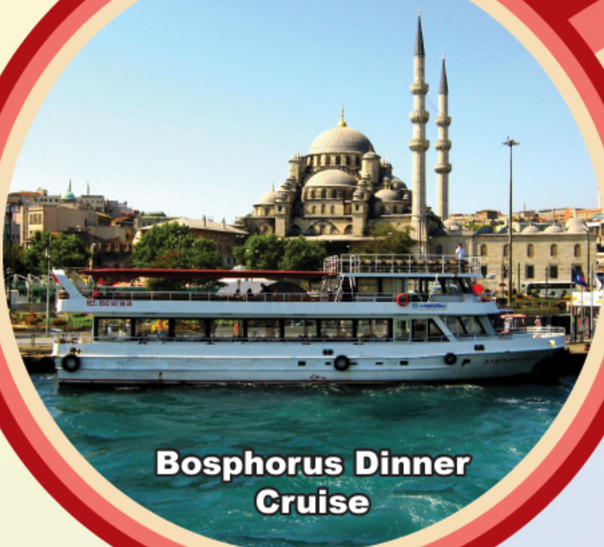
Bosphorus Dinner Cruise