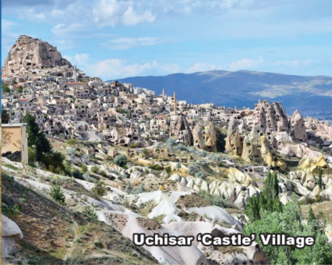
Uchisar 'Castle' Village