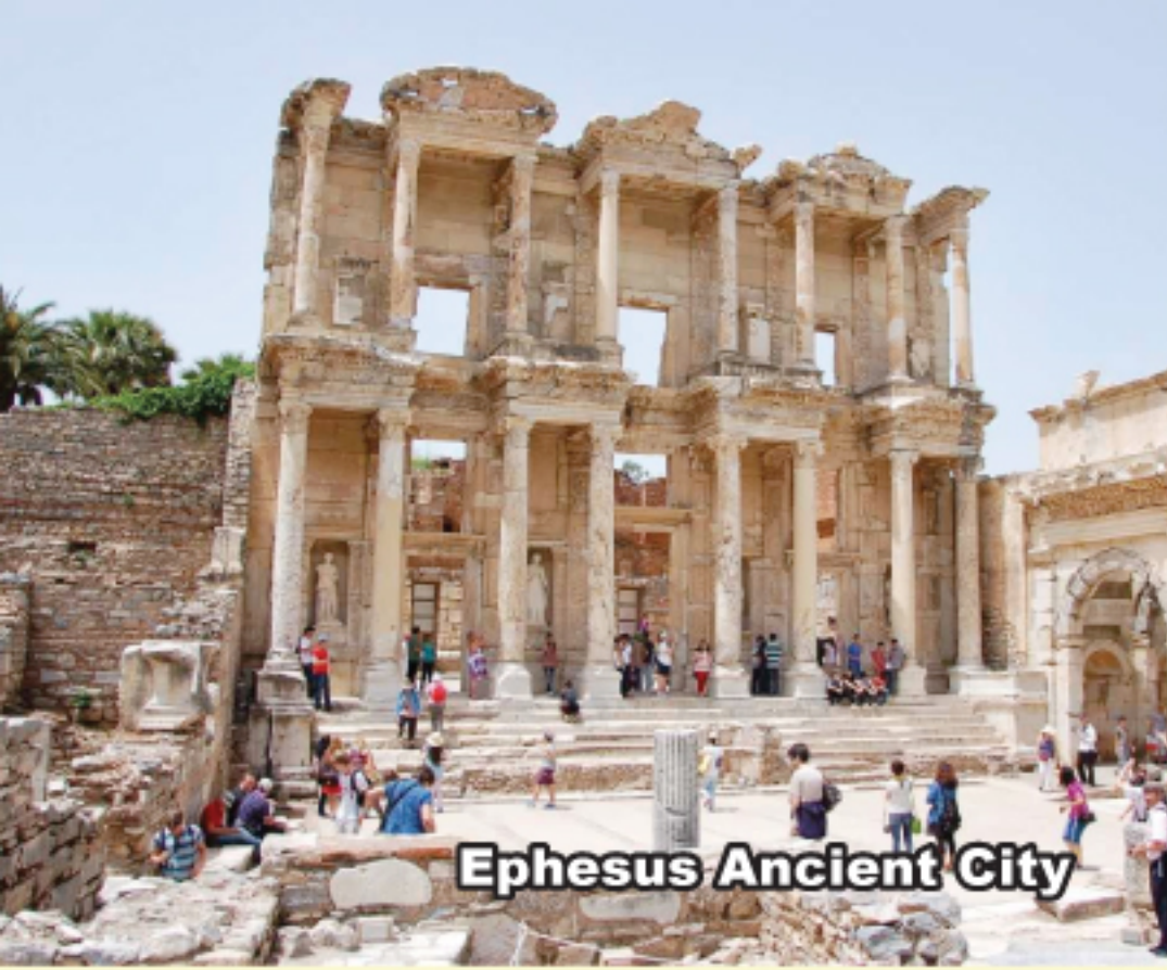
Ephesus Ancient City