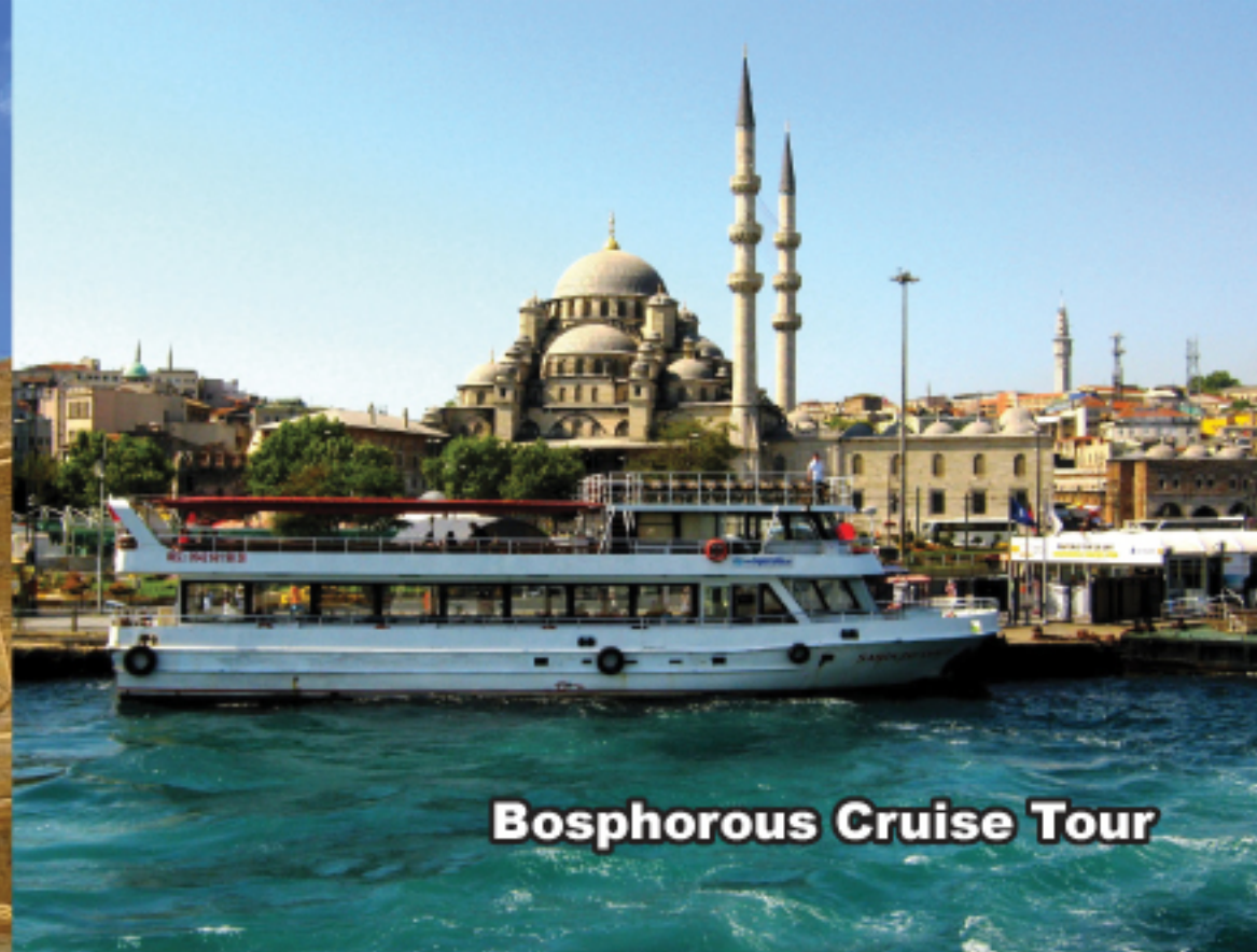
Bosphorous Cruise Tour