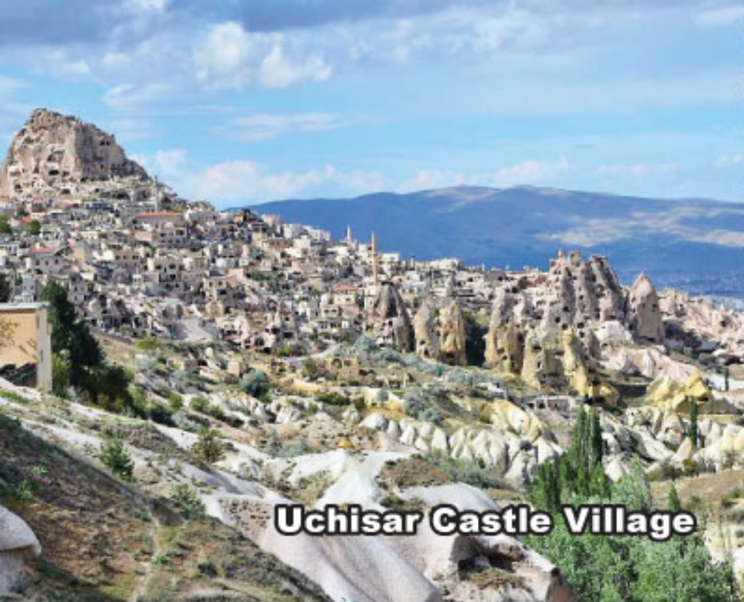
Uchisar Castle Village