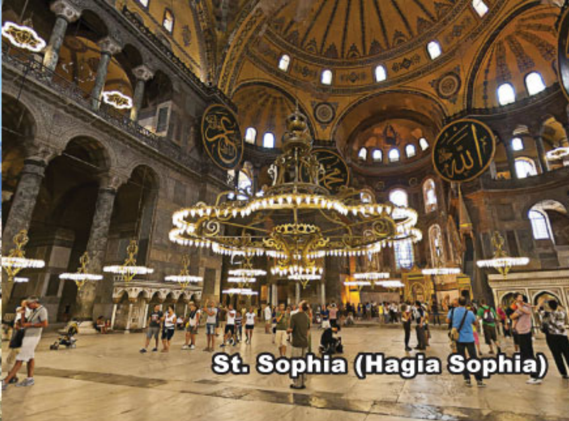
St. Sophia (Hagia Sophia)