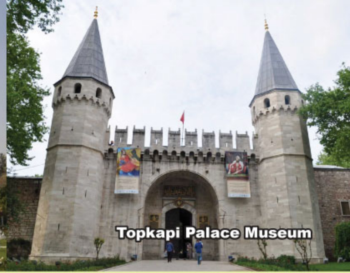
Topkapi Palace Museum