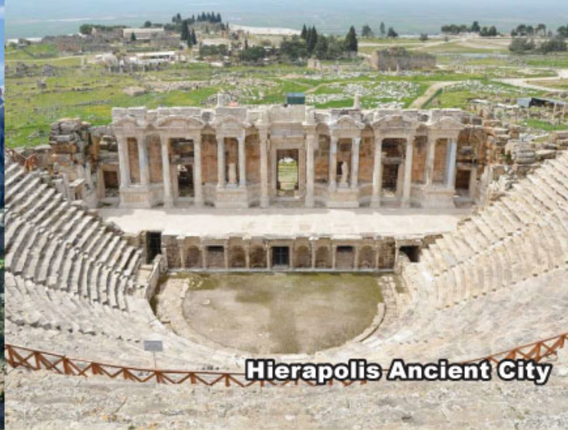
Hierapolis Ancient City