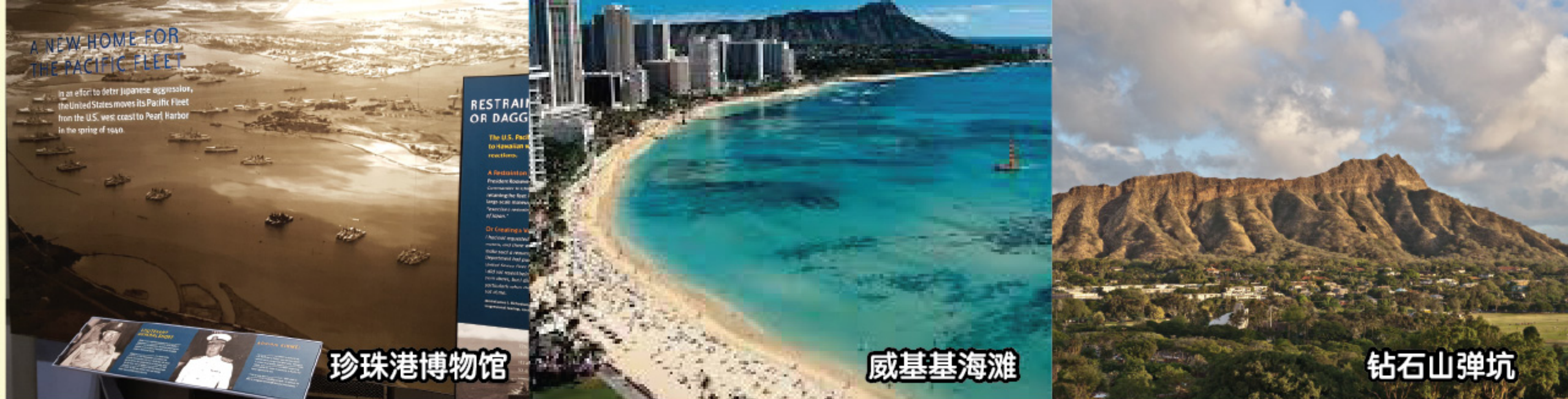
A NEW HOME FOR THE PACIFIC FLEET In an effort to deter Japanese aggression, the United States moves its Pacific Fleet from the U.S. west coast to Pearl Harbor in the spring of 1941.