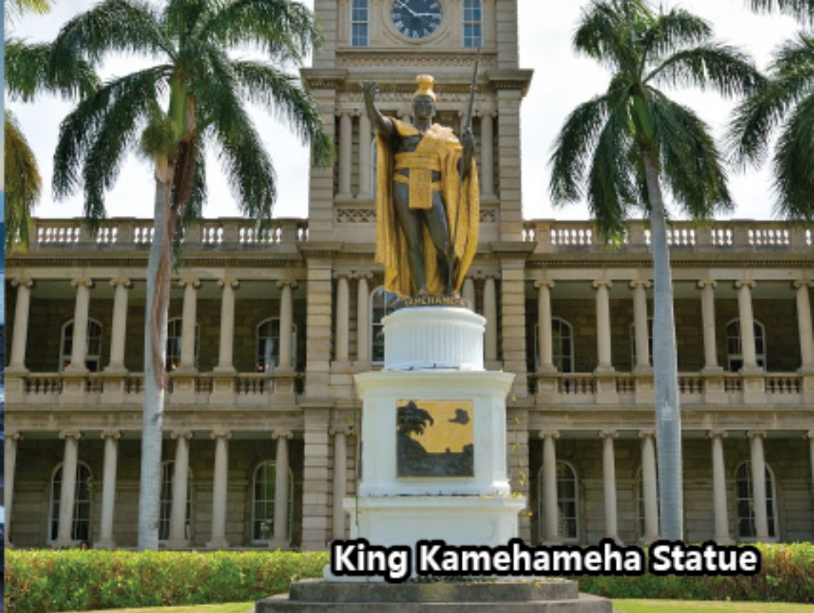
King Kamehameha Statue