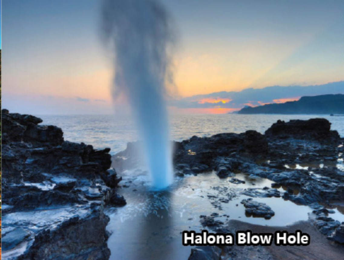
Halona Blow Hole