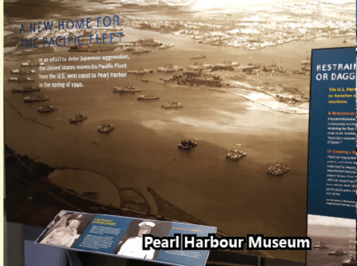
Pearl Harbour Museum