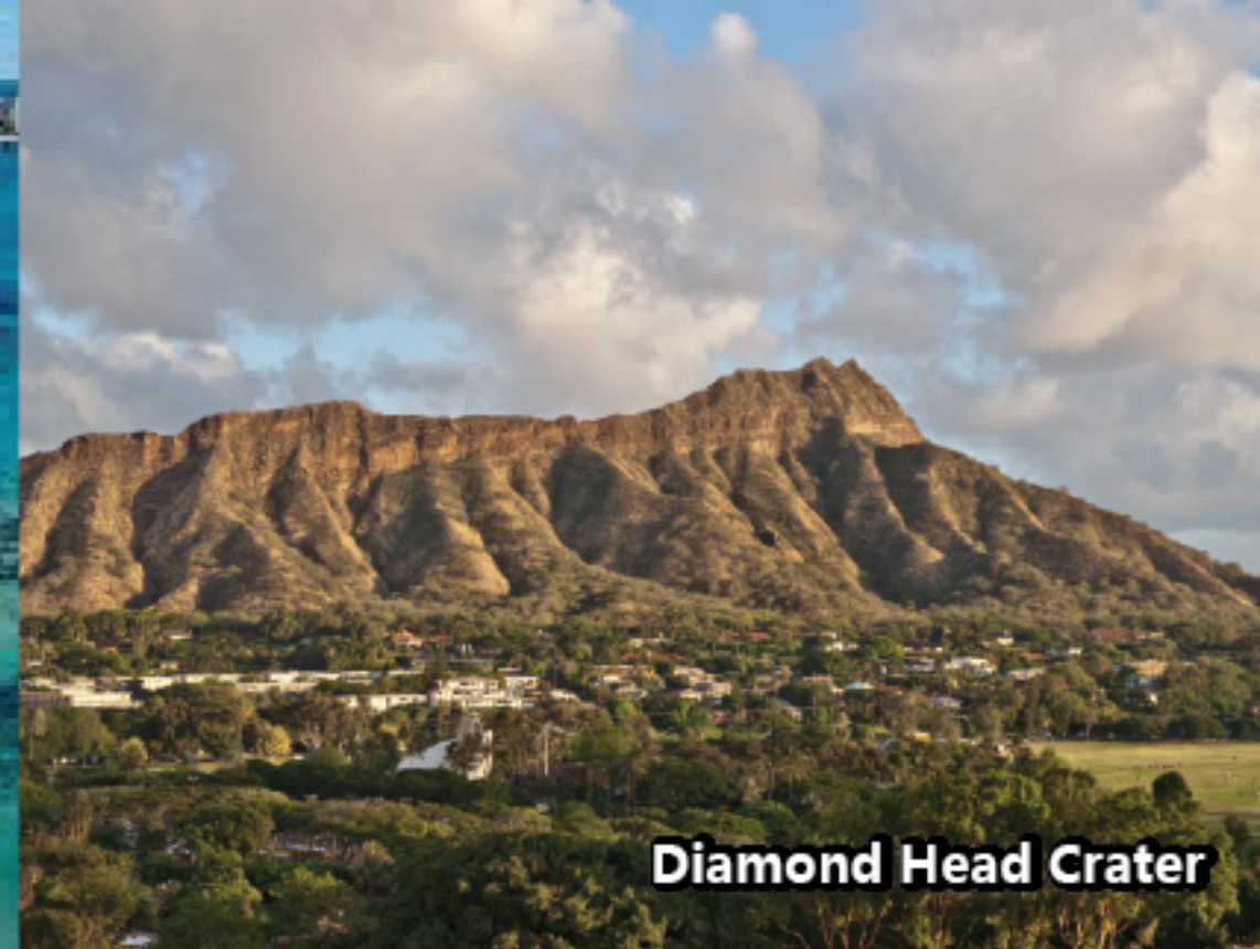
Diamond Head Crater