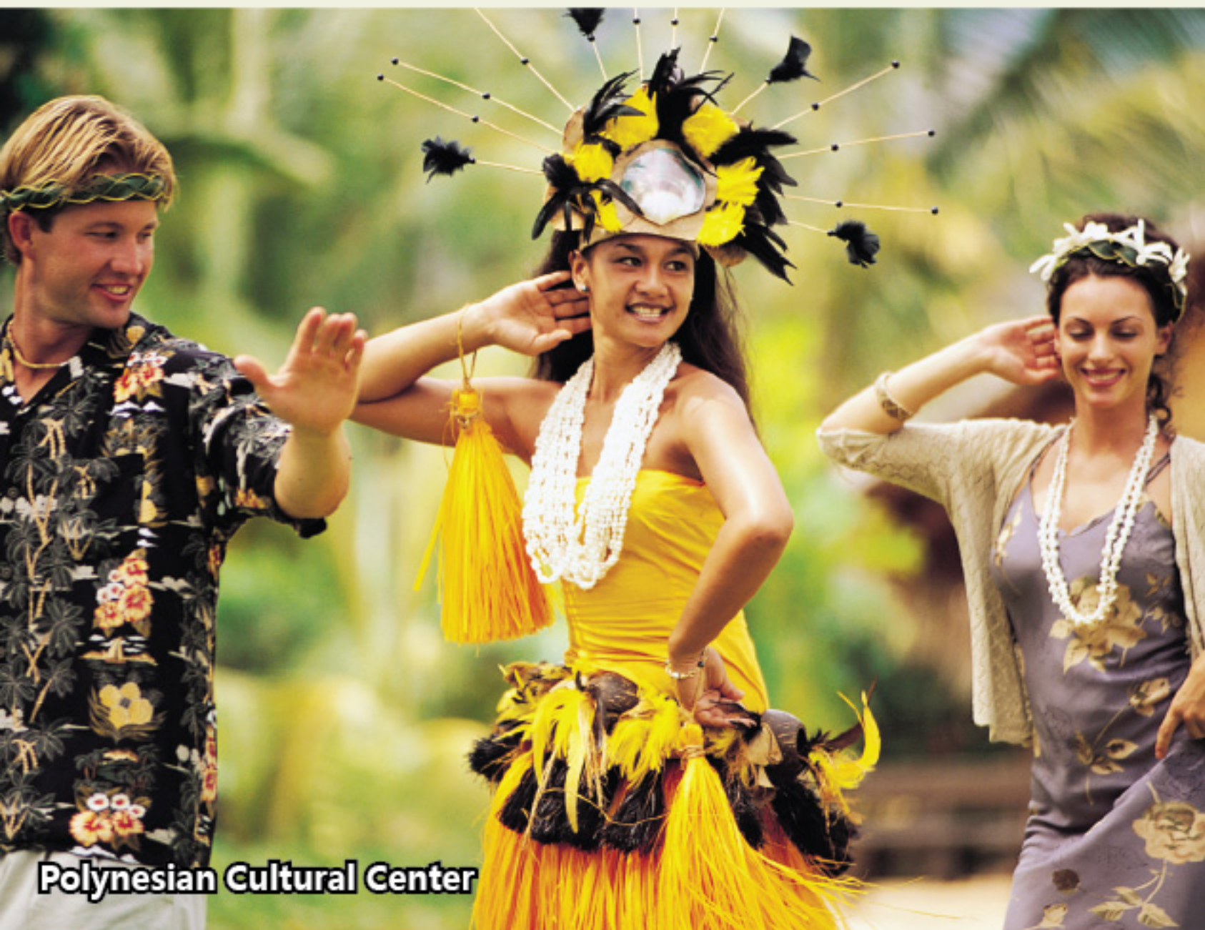
Polynesian Cultural Center