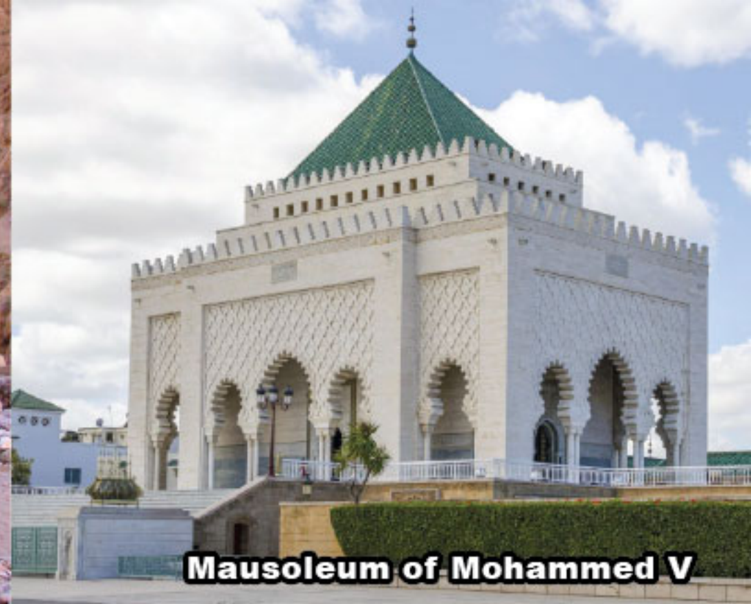
Mausoleum of Mohammed V