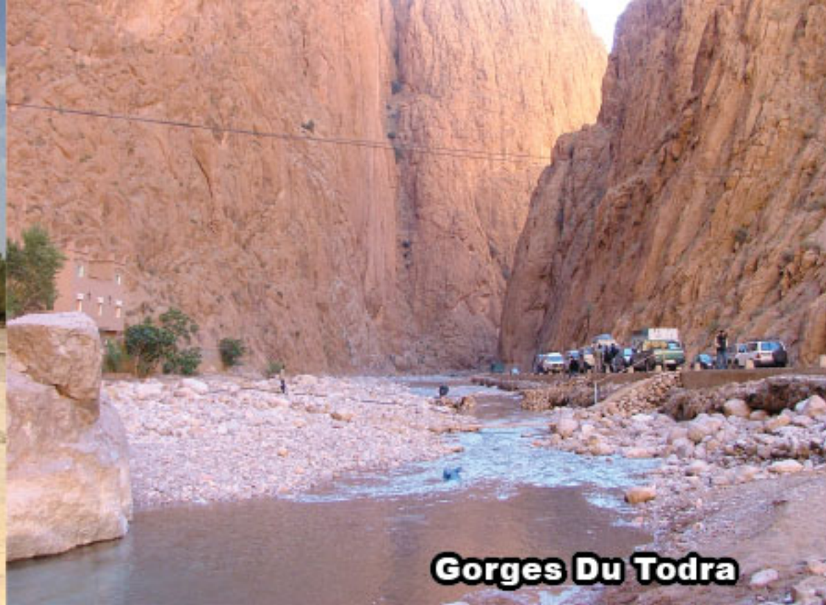
Gorges Du Todra