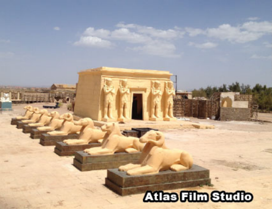
Atlas Film Studio