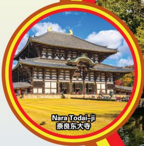
Nara Todai-ji 奈良东大寺