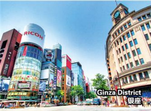
Ginza District 銀座