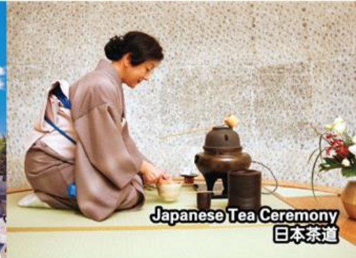
Japanese Tea Ceremony 日本茶道