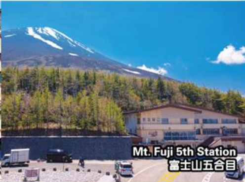
Mt. Fuji 5th Station 富士山五合目