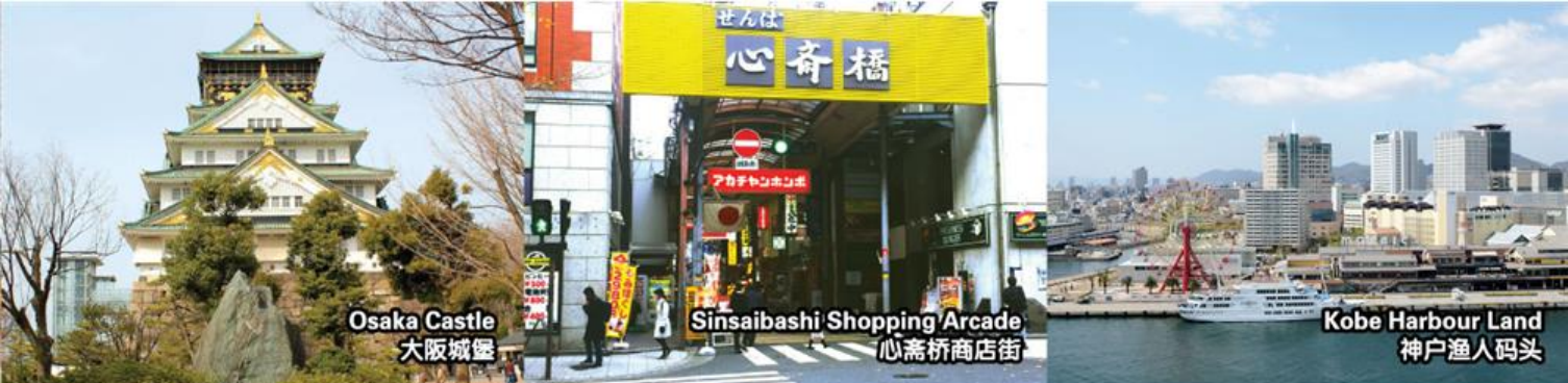
Osaka Castle 大阪城堡