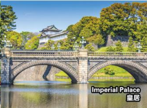
Imperial Palace 皇居