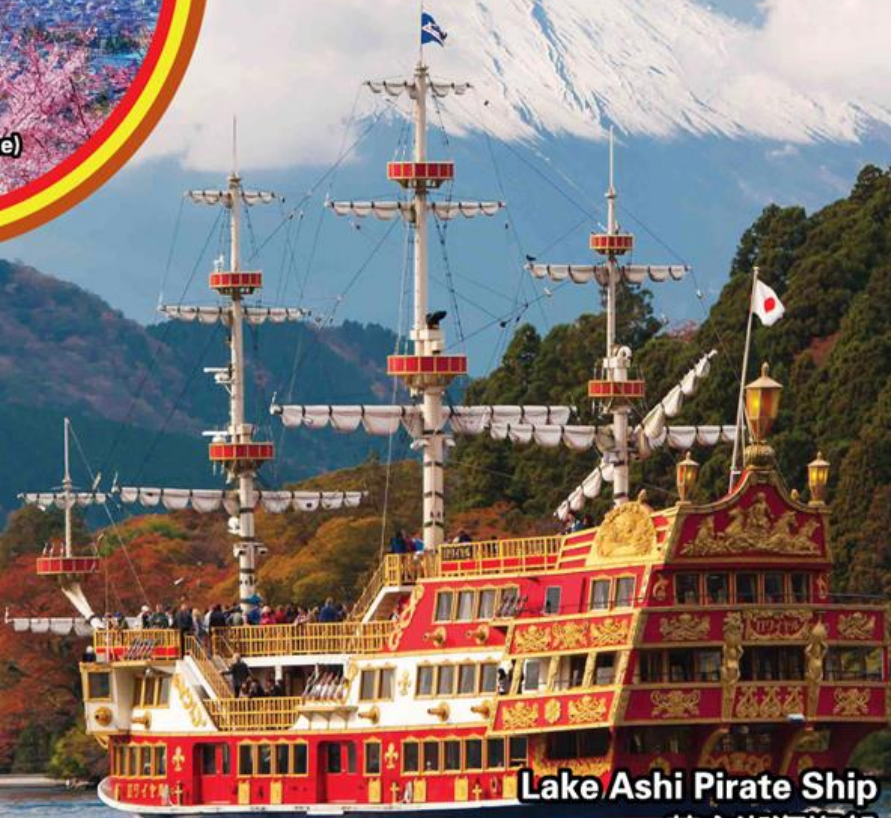
Lake Ashi Pirate Ship 芦之湖海盗船

行程次序·以当地旅社安排为准。 Sequences of Itinerary are subject to local arrangement.