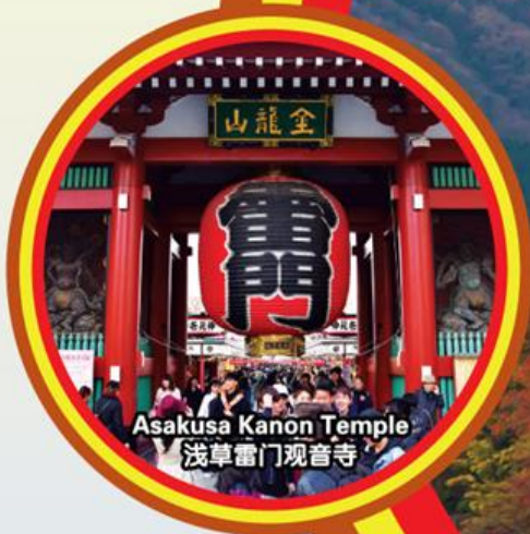
Asakusa Kanon Temple 浅草雷门观音寺