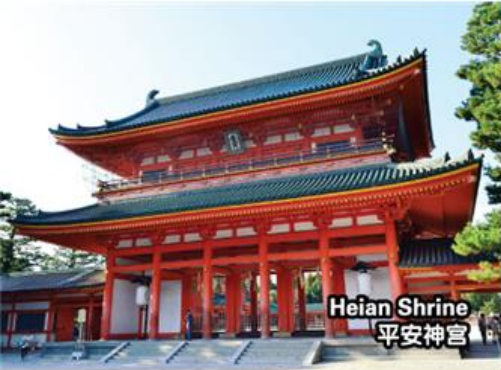
Heian Shrine 平安神宮