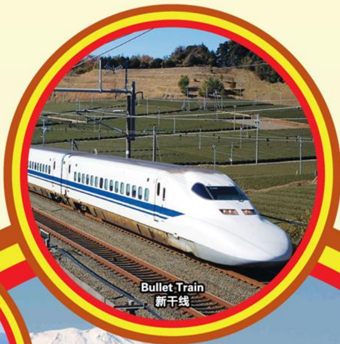
Bullet Train 新干线