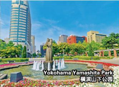
Yokohama Yamashita Park 横滨山下公园