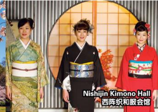
Nishijin Kimono Hall 西阵织和服会馆