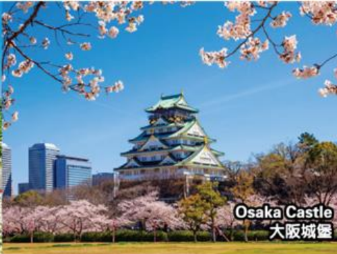
Osaka Castle 大阪城堡